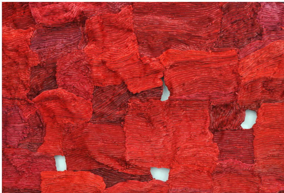
Bottom Detail of Jane Lee's Belong Series II (2011). Mixed media on canvas, 125 x 200 x 10 cm