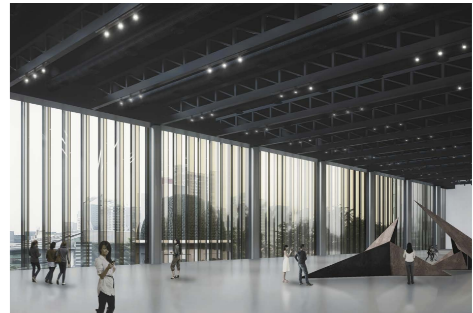
The new Singapore Art Museum, designed by SCDA, will bring contemporary architecture into the museum’s heritage buildings and introduce new spaces for the public to engage with art. The new complex will include an entrance plaza (top) and a purpose-built Sky Gallery (bottom)